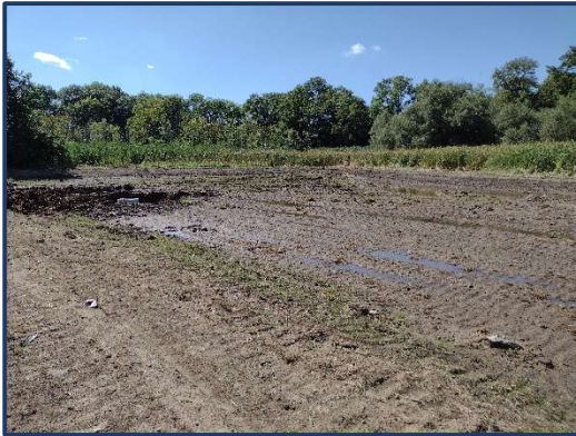
September 1, 2022 Invasives area