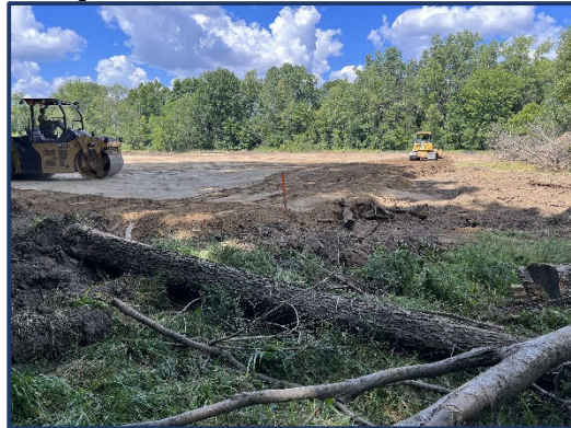
August 18, 2022 Grading