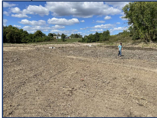
September 13, 2022 Culverts by east wetlands