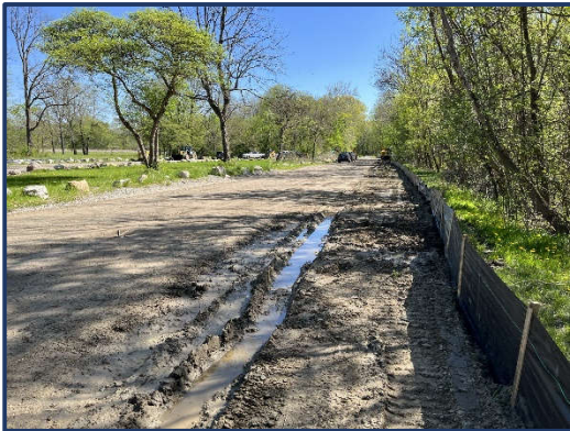
May 13, 2022 Silt fence