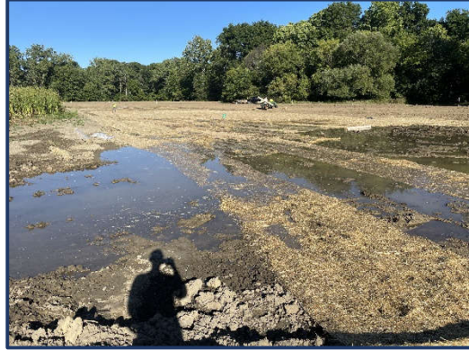
September 9, 2022 West wetland stabilization