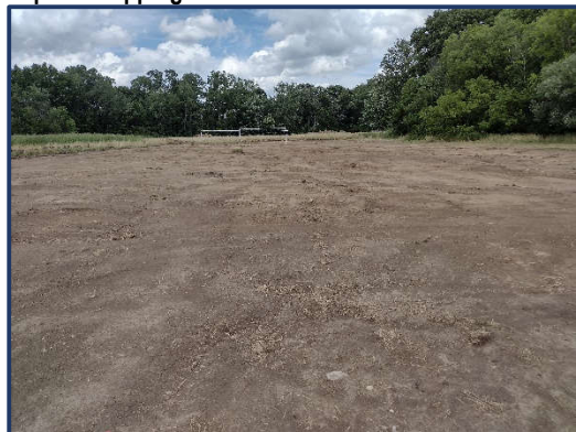
July 28, 2022 Topsoil stripping