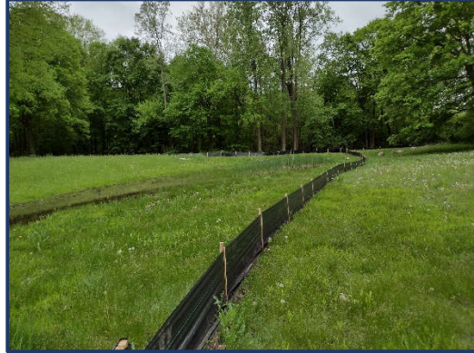
May 20, 2022 Silt fence