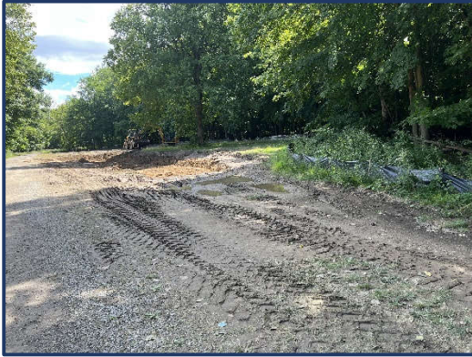
August 9, 2022 Excavating wetland by the road