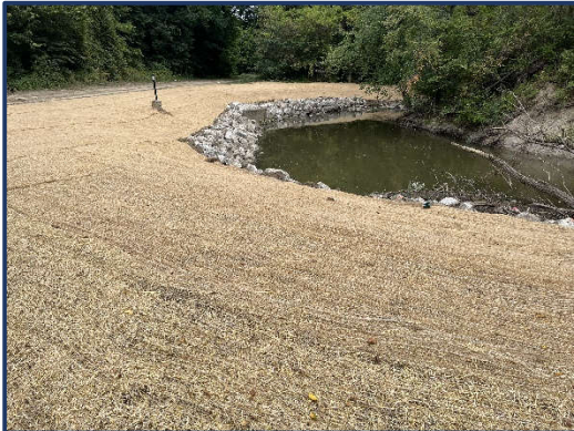
September 6, 2022 Streambank Stabilization