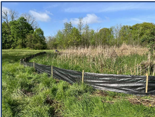
May 19, 2022 Silt fence