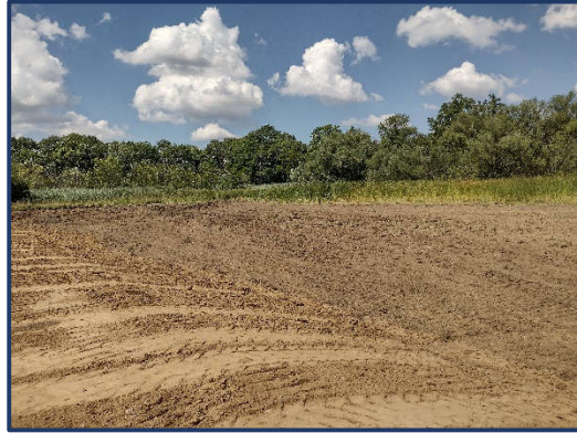
August 16, 2022 Grading wetland