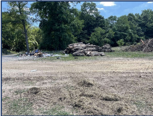
August 10, 2022 Trash and log piles