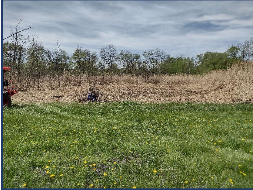
May 12, 2022 Invasives removal