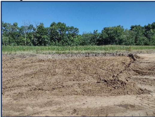
August 12, 2022 Grading wetland