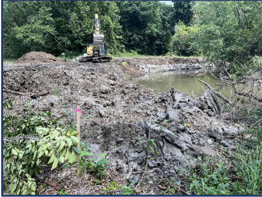
August 30, 2022 Excavating by the creek